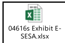
EXHIBIT E – BID PRICE WITH MANDATORY MANUFACTURERS LIST]

Awarded Manufacturers (Product Lines per your Bid): SES America