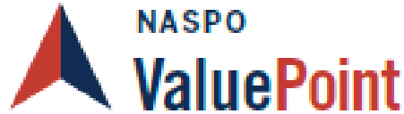
Exhibit A: NASPO ValuePoint Master Agreement Terms and Conditions